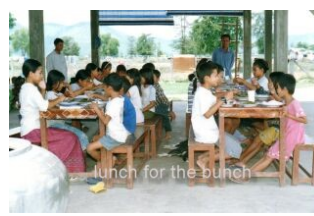
"Lunch for the Bunch". Our older children enjoying lunch at Sunshine House.