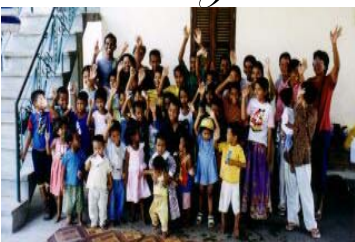
Our Children & staff at Sunshine House

Awareness Cambodia funds Sunshine House through the generous donations and sponsorship of people like you. We thank you for standing in the gap on behalf of these