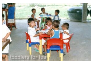
"Toddlers for Tea". Dinner time at Sunshine House.