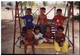
"Always lots of friends to play with at Sunshine House". The swings and sandpit are a great meeting place at SH.