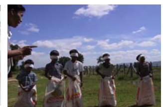
Christmas party at Sunshine House. The sack races were a big hit.