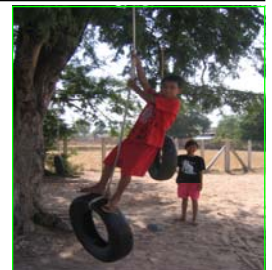
Above and Right: Children at Sunshine House having fun!