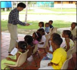
Above: Children receiving Riel

Our children thought they were millionaires!