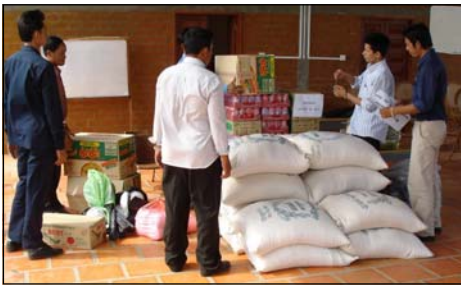
Above: Gifts from the Government of Cambodia